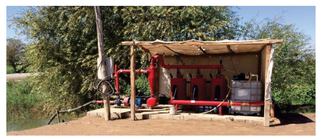
Photo 2. Installation for a drip irrigation system

The 16-mm diameter drip irrigation pipe had emitters spaced at 60 cm; the emitter discharge rate was 2 dm<sup>3</sup>·h<sup>-1</sup> at the 1000–1500 hPa operating pressure.