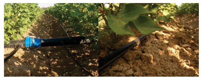
Photo 3. Layout of main and distribution pipes