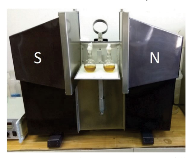
Photo 1. A magnetostatic device generating a static magnetic field

A magnetostatic device producing a static MF of 7 mT was used for the tests. The magnetic circuit consisted of two blocks of magnets installed on the outer side of the poles, connected by MF expanders (Photo 1). With this setup, a constant, homogeneous MF was obtained, which was calibrated using a microteslometer for the experiment at 7 mT. Field homogeneity measurements were carried out on seven horizontal sections in the exposure zone. According to the histograms made in the Statistix 3.5 programme, the device provides a homogeneous field in the exposure zone between the poles, with a maximum deviation of \pm 10\% from the mean value. The magnetic field direction is marked in Photo 1. The maximum field uniformity deviation is 2°.