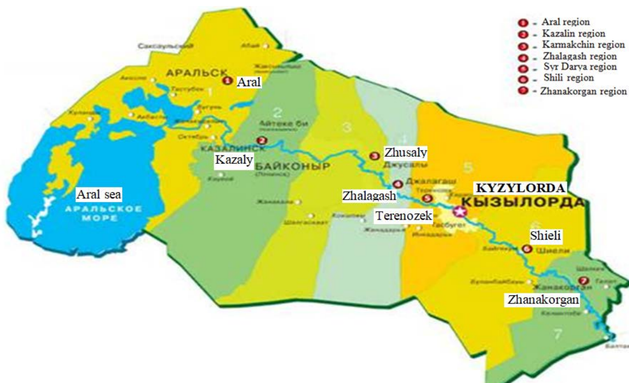
Fig. 1. Administrative map of Kyzylorda region of the Republic of Kazakhstan