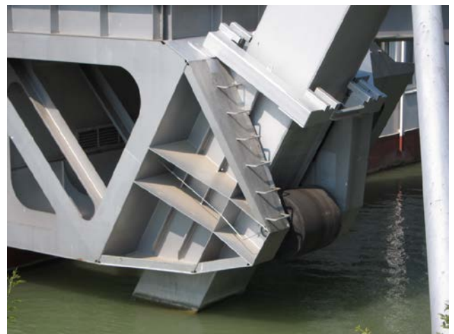
Photo 7. Bertha von Suttner Gymnasium: a shiftable mooring element

the ground level of Donauinsel. When the dam was constructed in 1997 and the river swelled, the mounting of gangways to the bank was elevated and the barges were accessible to people moving on wheelchairs (Photo 5). Inside the barges all the levels are accessible also by lifts installed in each of the three units.