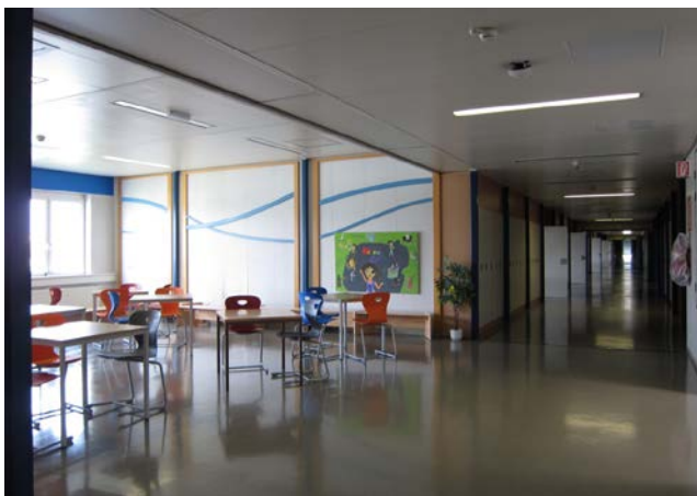
Photo 3. Bertha von Suttner Gymnasium: corridor – doors to classrooms and student relaxation area

a dead weight of approximately 6500 t. Each of the two teaching units has got two decks all along and an additional third deck in the superstructure in the bow part. Internal layout of both teaching units is the same, being also similar to that of Asile Flottant – two rows of pillars form central corridors (Photo 3). Each unit is almost 140 m long. The school was designed for approx. 1000 students and 100 teachers. The main entrance and lobby are located on the second deck, in the front part of the unit on the bank side. School administration offices such as Secretariat, Headmaster’s Office, other administration offices and a concert hall as well as other rooms, such as a nurse room, are adjacent to the lobby.