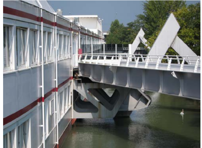
Photo 5. Bertha von Suttner Gymnasium: broadside adjacent to the river bank, gangway to the auxiliary entrance (phot. G. Rytel)