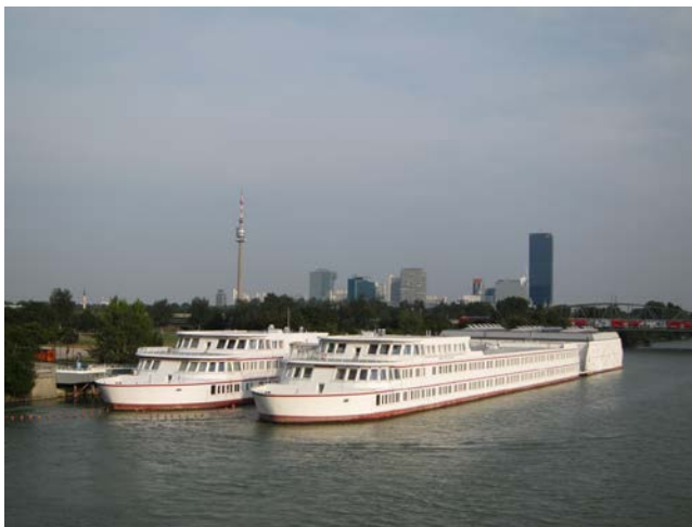
Photo 2. Bertha von Suttner floating school – general view

differences between them. Firstly, there is a 65 year gap between the time each of them was opened for use; secondly, they float on two different rivers – the Seine and the Danube; thirdly – the purpose of each of them is different – one was a shelter, the other one is a school. What connects them and makes them worth attention, however, is that they provide services to local community and they are quite valuable pieces of floating architecture which are parts of the European architectural heritage.