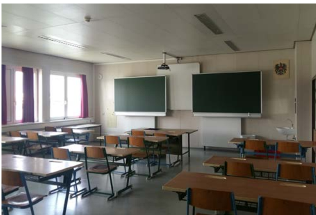
Photo 8. Bertha von Suttner Gymnasium: classroom interior

An unusual location of the school breaks down the daily school routine and mitigates the learning and teaching hardships for students and teachers. The glittering waves of the beautiful blue Danube, broad prospects, slowly passing huge transportation barges and fast speeding motorboats seen from the windows – all this makes studying more attractive and encourages to follow the daily routine. Teachers seek to be assigned a classroom with a view to the river (Photo 8). Classrooms with windows with a view to the island are much less liked. Working in so unusual and original – in terms of a big city – environment is a positive stimulant which facilitates community integration.