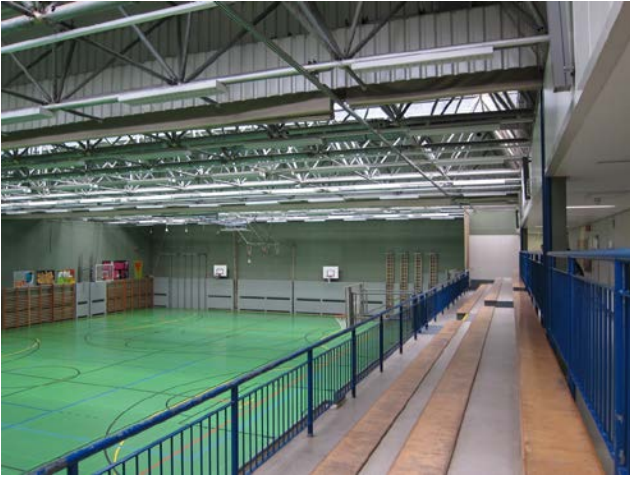
Photo 4. Bertha von Suttner Gymnasium: “Gym Island” – the school gym, a view from the auditorium